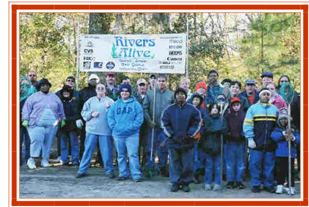
Ochlockonee River Basin Thomasville

Funding for this brochure was provided in part through a grant from U.S. Environmental Protection Agency under the provisions of Section 319 (h) of the Federal Clean Water Act.