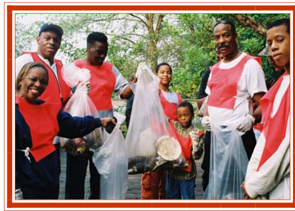
Chattahoochee River Basin Roswell