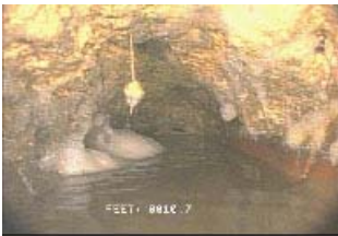
Grease on walls of a sewer pipe

Fats, oils, and grease, known collectively as FOG, are the leading cause of clogs in our public sewer system.